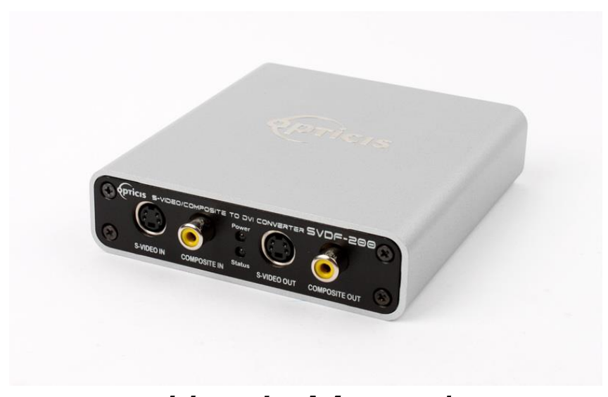
User's Manual SVDF-200